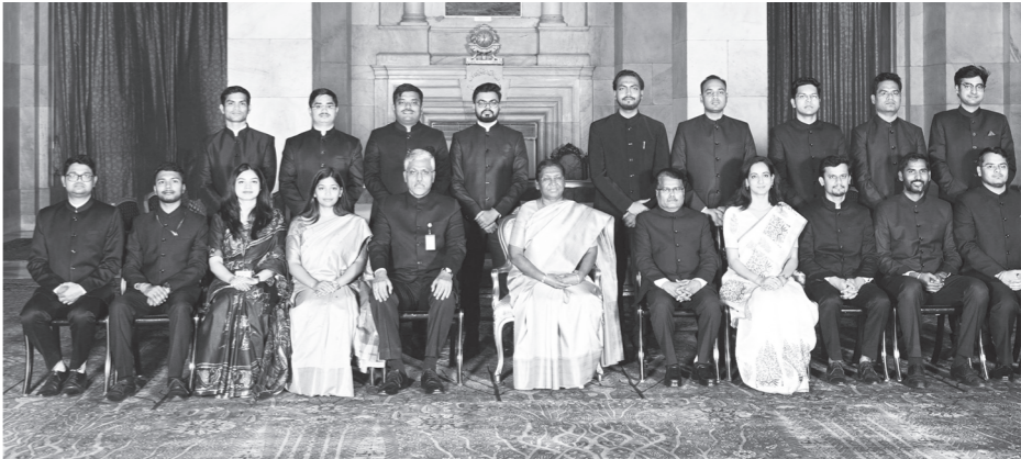
President Droupadi Murmu in a group photograph with Probationers of Indian Fisheries Service (2022 batch) and Officers/Officer Trainees of Indian Defence Estates Service (2018 and 2022 batch) at Rashtrapati Bhavan, in New Delhi

minister Anitha R Radhakrishnan said that Stalin will participate in the meeting scheduled on August 18, based on an invitation from the fishermen representatives. An official release quoted him as saying that the CM has repeatedly taken up the fishermen issue with Prime Minister Narendra Modi and External Affairs Minister S Jaishankar through written communication as well as over the telephone. He recalled that Stalin had written last week to the Prime Minister, urging him to take up with the then visiting Sri Lankan President Ranil Wickremesinghe, protecting the traditional fishing rights of the Tamil Nadu fishermen. (PTI)